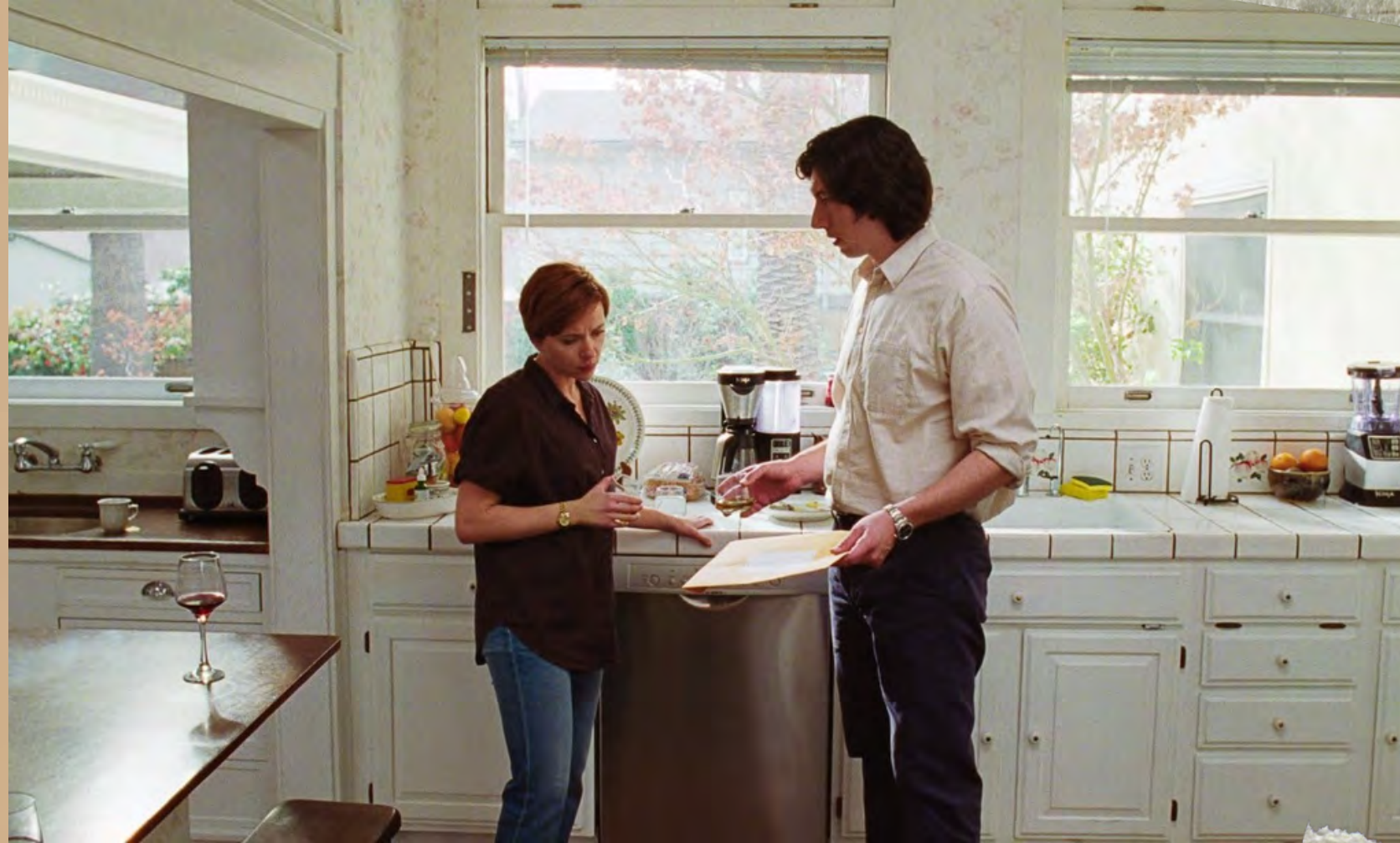
Marriage Story (2019) dir. Noah Baumbach