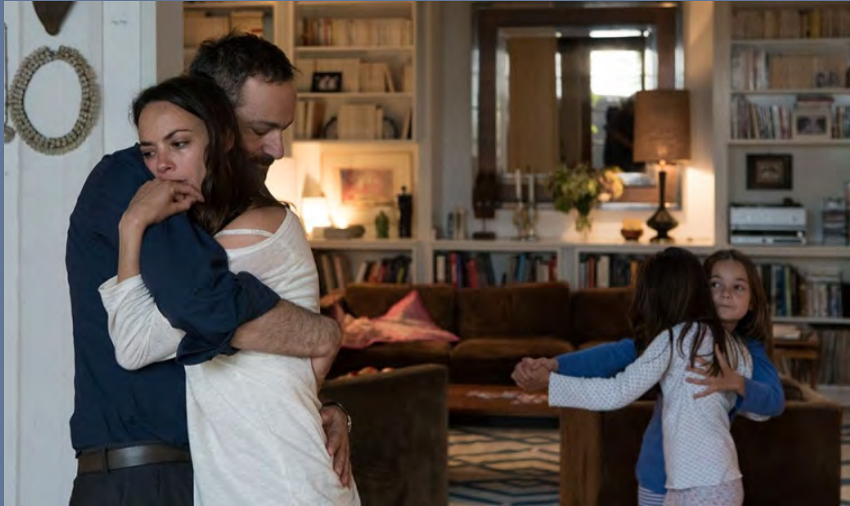
After Love (2016) dir. Joachim Lafosse