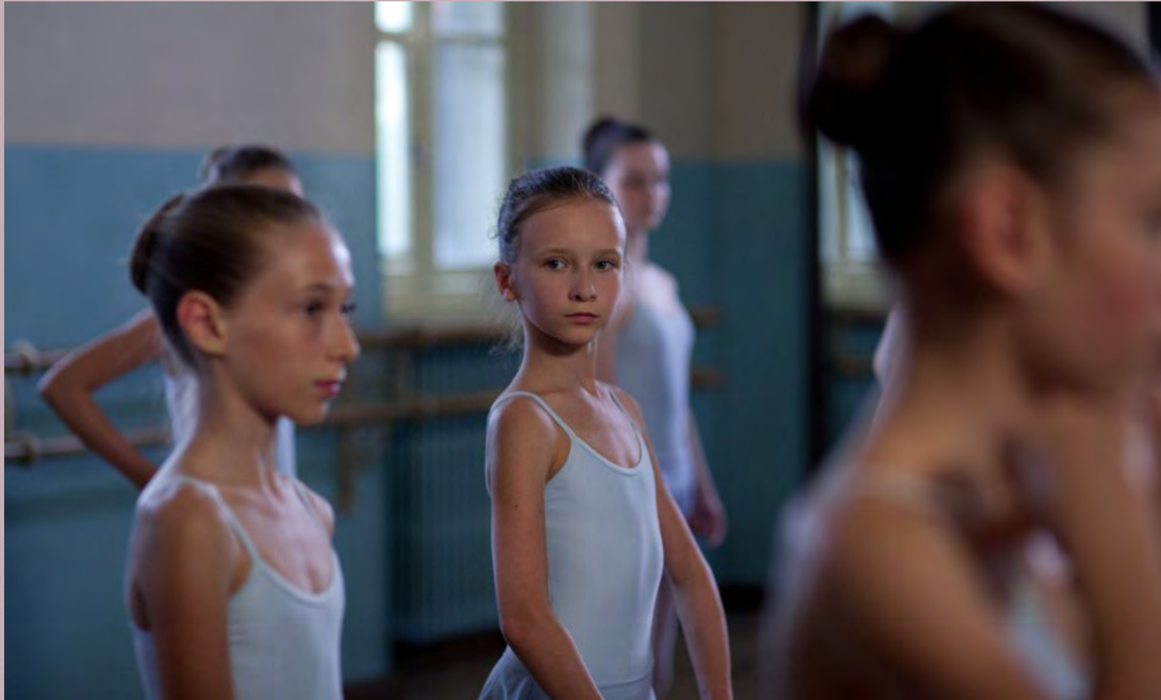
Polina (2016) dir. Valérie Müller & Angelin Preljocaj