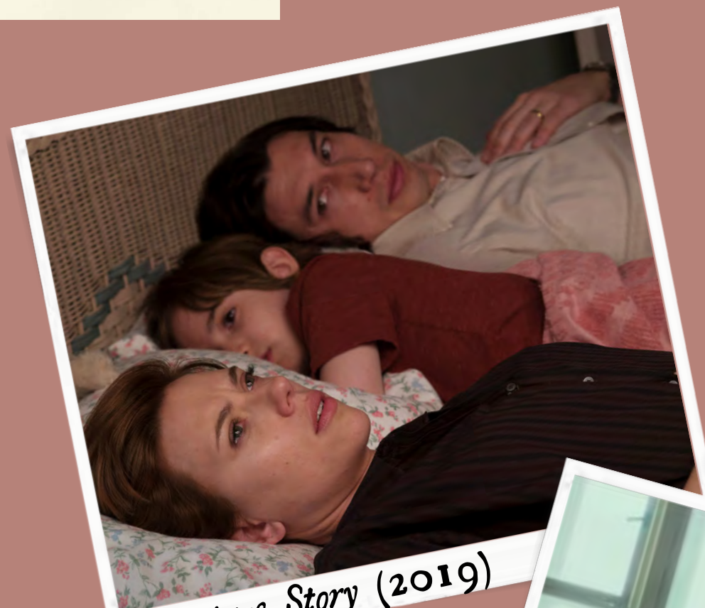
Marriage Story (2019) dir. Noah Baubachman