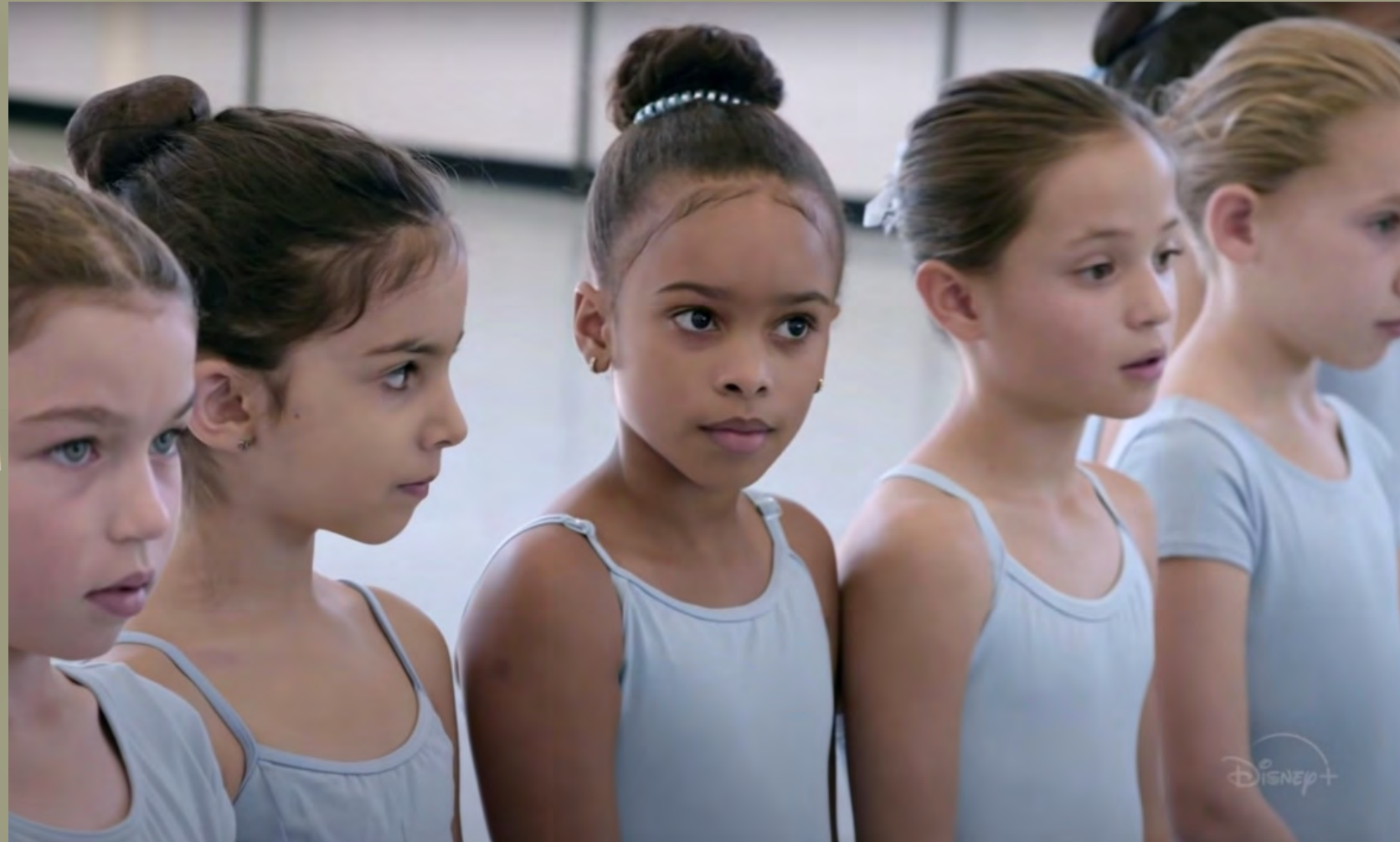
On Pointe (2020) dir. Larissa Bills